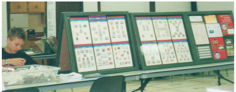
The "Young Persons" area at the Show

So, all in all, yes – another pretty good show!