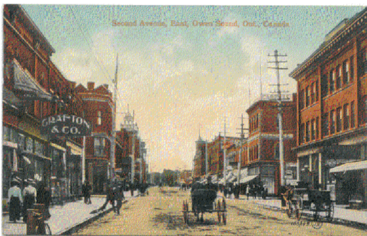
Above: An early postcard showing 2nd Ave. E. in Owen Sound